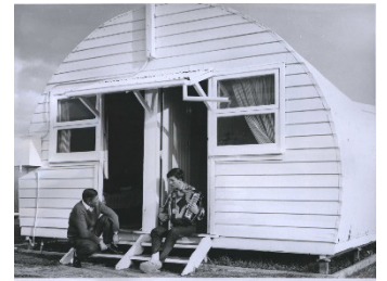
Image courtesy of the National Archives of Australia NAA: A12111 1/1964/22/2

Like the two people in this photograph taken at Balgownie Hostel are you one of the many people who migrated to Australia and ended up living in a migrant hostel either at Balgownie (later called Fairy Meadow), Berkeley or Unanderra Hostels. If so, please share your stories and memories here of your early days in Wollongong.